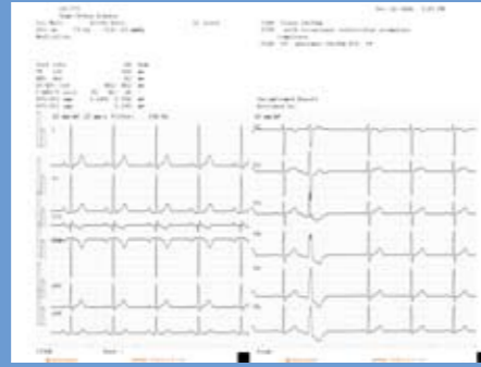
12 lead ECG 6 traces, analysis results ( setting gain + auto gain)