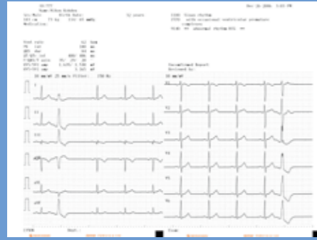
12 lead ECG 6 traces, analysis results ( auto gain )