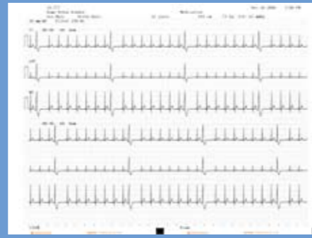
1 or 3 channel rhythm recording