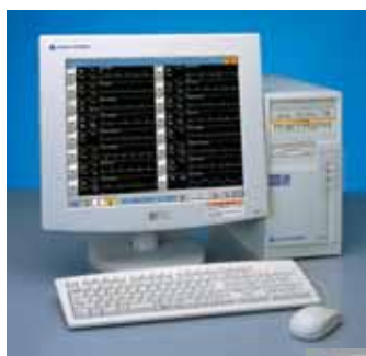
Central monitor CNS-9701J/K Multiple patient receiver, ORG-9700J/K