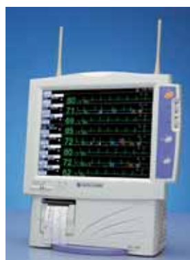
Telemetry system WEP-4204/4208J/K

This brochure may be revised or replaced by Nihon Kohden at any time without notice.