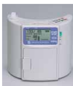
ZS-940PK NIBP, ECG, Resp, SpO 2