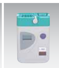
ZS-930PK ECG, Resp, SpO 2