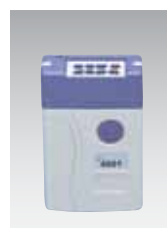
ZS-920PK ECG, Resp